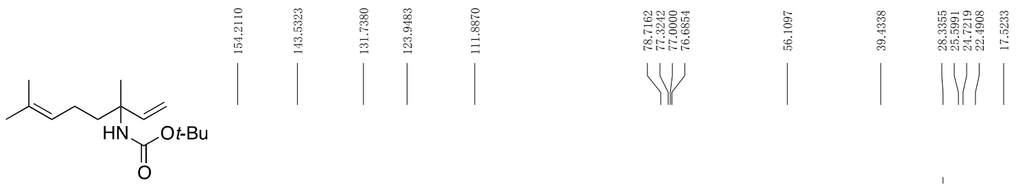
6 (after chromatography)