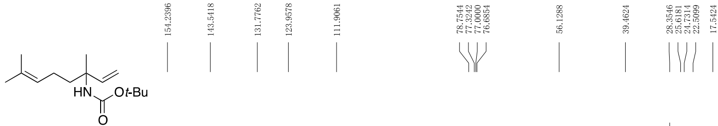
6 (after Kugelrohr distillation)